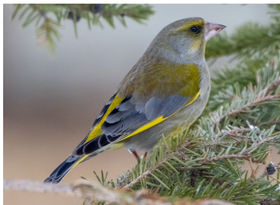
Bird boxes and shelters across the site will also be implemented.