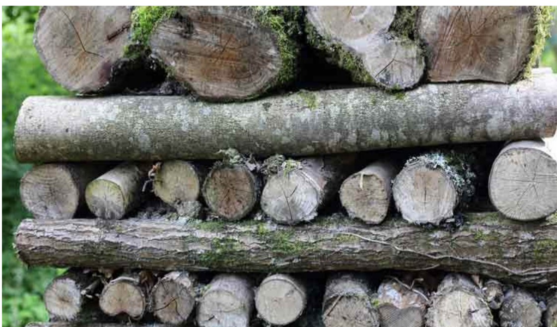
Insect hotels and log piles will be added to the site to provide a safe haven for wildlife.